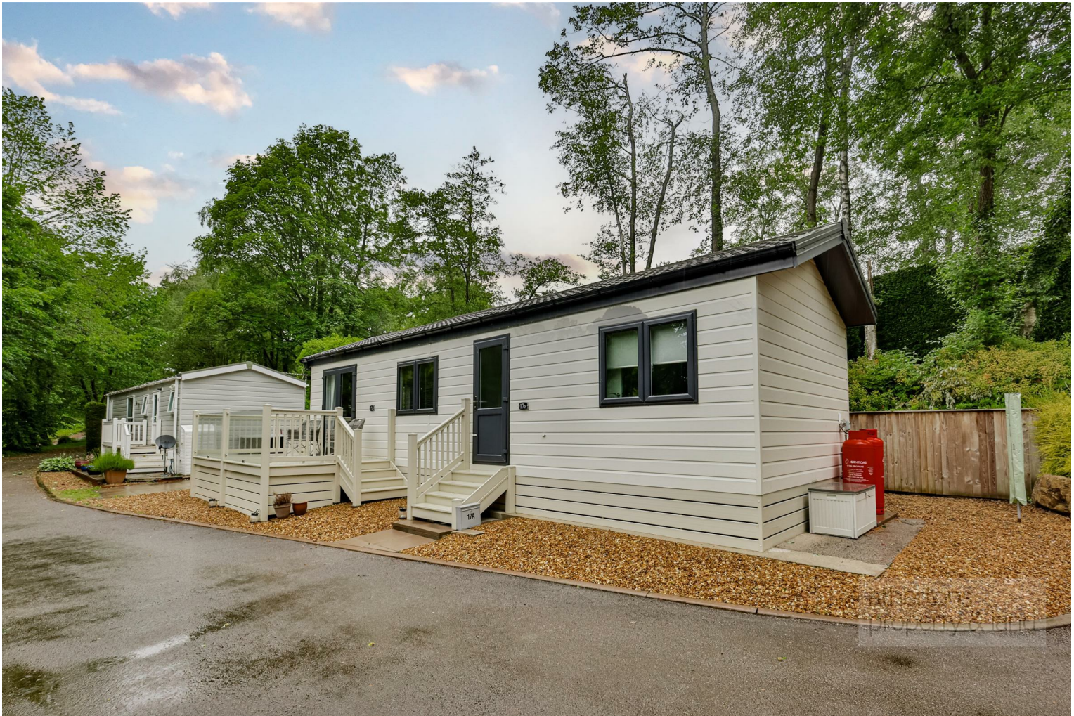
17a Willow Close, Shireburne Park, Waddington